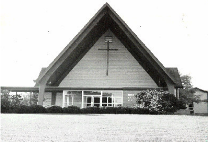
Broadway Covenant Church 3525 Broadway Covenant Church Rockford, IL 61108

You are invited to a graduation celebration picnic for Joyce Cosman on Saturday June 14, 2008 at 1:00 p.m. in the afternoon at the Lake Side Pavilion, Diecke Park on Route 47 in Huntley, IL. No gifts please! In lieu of a gift you may bring one of the following for the Hispanic Food Pantry in Elgin. A bag of white rice; a can of refried beans; a jar of peanut butter or a jar of grape jam; or a large box of cold cereal. RSVP to Sue at the Church Office 815-399-9295 or Joyce Cosman at 847-669-9484 Directions and map will be posted at the church office.